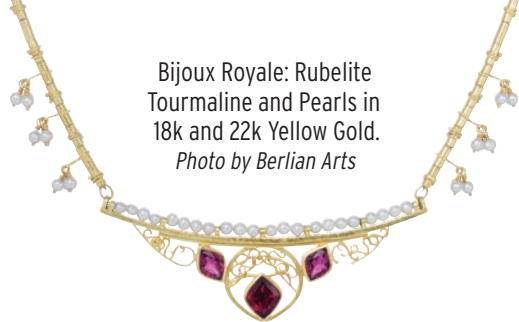
Bijoux Royale: Rubelite Tourmaline and Pearls in 18k and 22k Yellow Gold. Photo by Berlian Arts