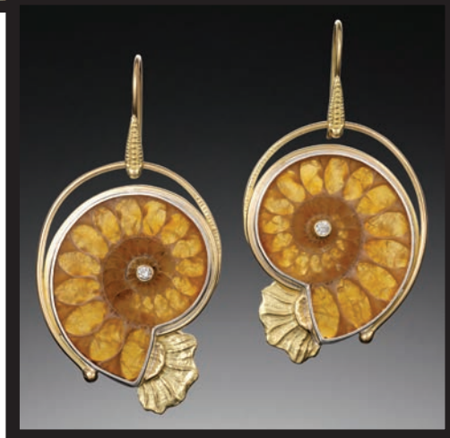
Nautilus Slices with Yellow Gold.